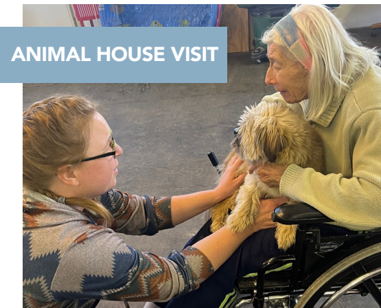
ANIMAL HOUSE VISIT