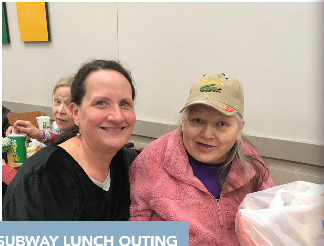
SUBWAY LUNCH OUTING

BEAUTYSHOP FROZEN HOPE RESIDENT CARE GENEROUS MOUNTVIEW SNOWFLAKE COLD GIVING NEWYEAR VOLUNTEER COMMUNITY GRANDFRIENDS OPPORTUNITY WELLNESS DONATION HOLIDAYS POSITIVITY WINTERTIME