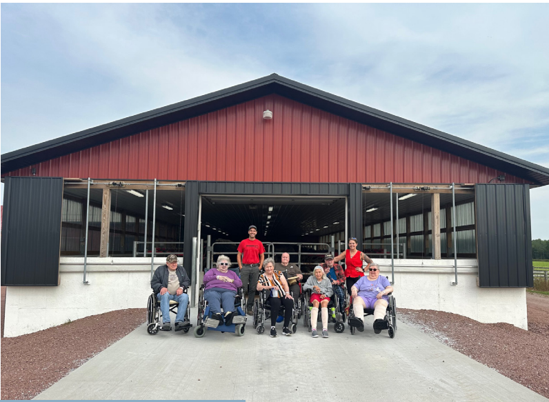
NINNEMAN FARM TOUR